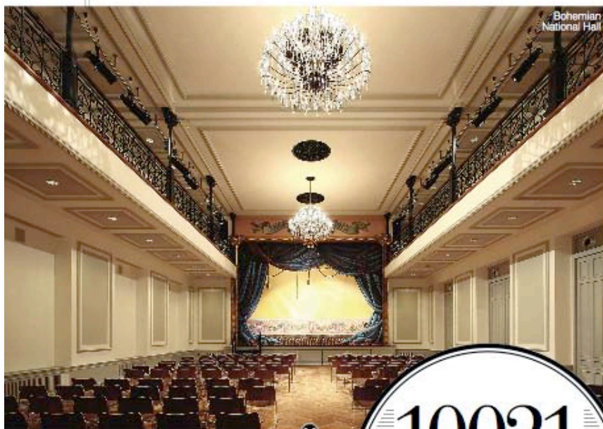
Bohemian National Hall